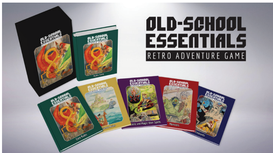
Product mockups—some cover art is still in development